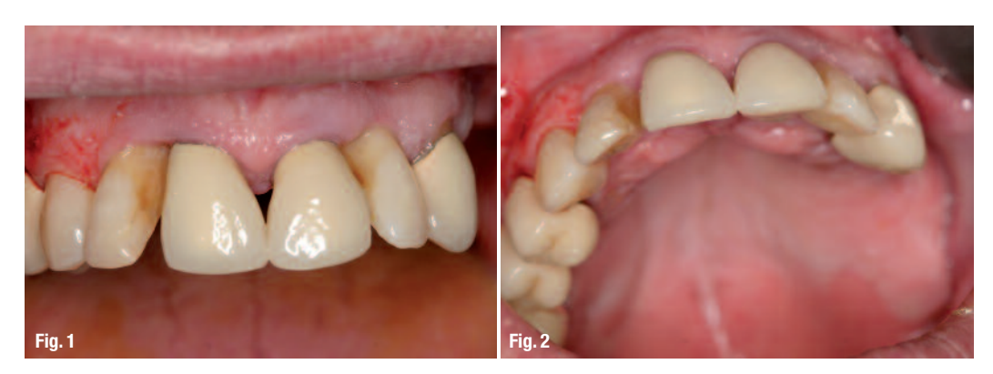
Fig. 1_Initial clinical situation. Fig. 2_Initial clinical situation, coronally.

The clinical examination showed a severe periodontal defect, screening index of Grade IV, pockets of up to 6 mm, tooth mobility grade II-III and a bleeding index of 3-4. The functionality was very limited and the aesthetic situation unsatisfactory. The existing prosthetics on the central incisors were too long to cover the recessions, resulting in further attachment loss. The aesthetics also were compromised, following periodontal fibre loss and bone support. Especially the lateral incisors suffered severely from loss of interproximal bone, followed by mesiorotations and ante-inclination (Figs. 1 and 2). Radiological findings confirmed that all four upper incisors needed to be extracted.